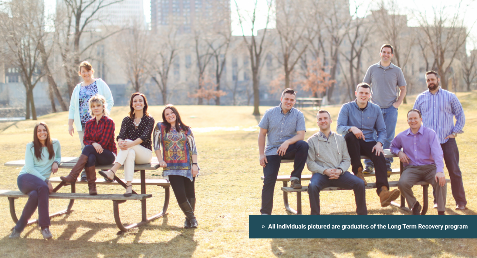
» All individuals pictured are graduates of the Long Term Recovery program